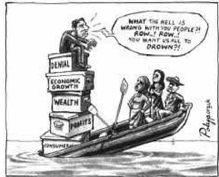
THE SAME BOAT